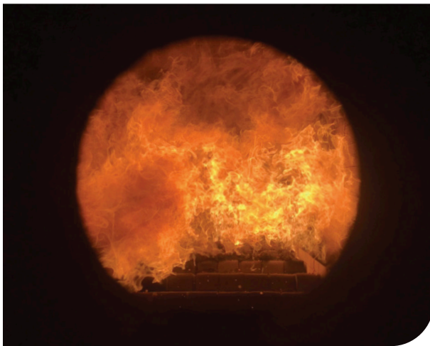
The combustion chamber heats up to 800 degrees Celsius, heating 36,000 square feet with 100 percent locally sourced wood biomass.

The pellets are also benefitting the local greenhouse. After combustion, the ash left from the burning of the pellets is collected in a massive bin that fills up approximately every 20 days. The product is transported to the greenhouse to be used as fertilizer for gardens; coming full circle to start a new cycle.