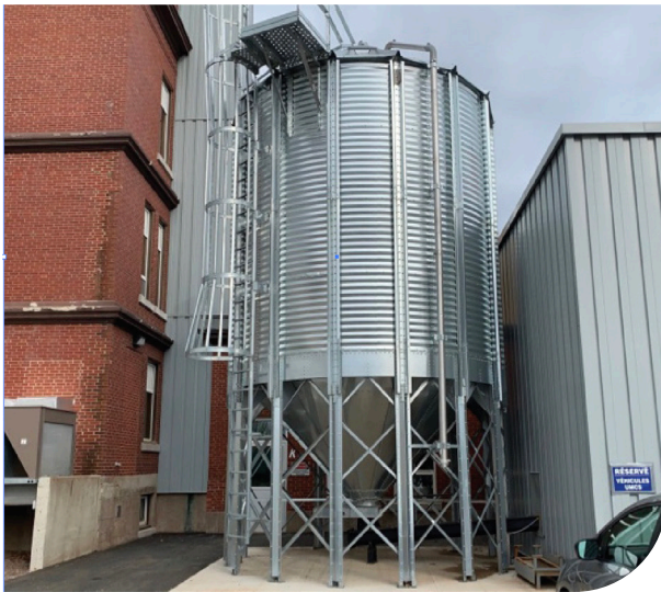
The farm-style silo holds approximately 30 tonnes of pellets and is refilled every 20 days in the depth of winter.

What do you get when you team up one of Canada's leading pellet manufacturers with an industrial heating specialist? Biomass Solutions Biomasse or BSB as its known in its home province of New Brunswick — a company that is charting new frontiers in North America and delivering environmental, social, and economic benefits for their customers and local communities.